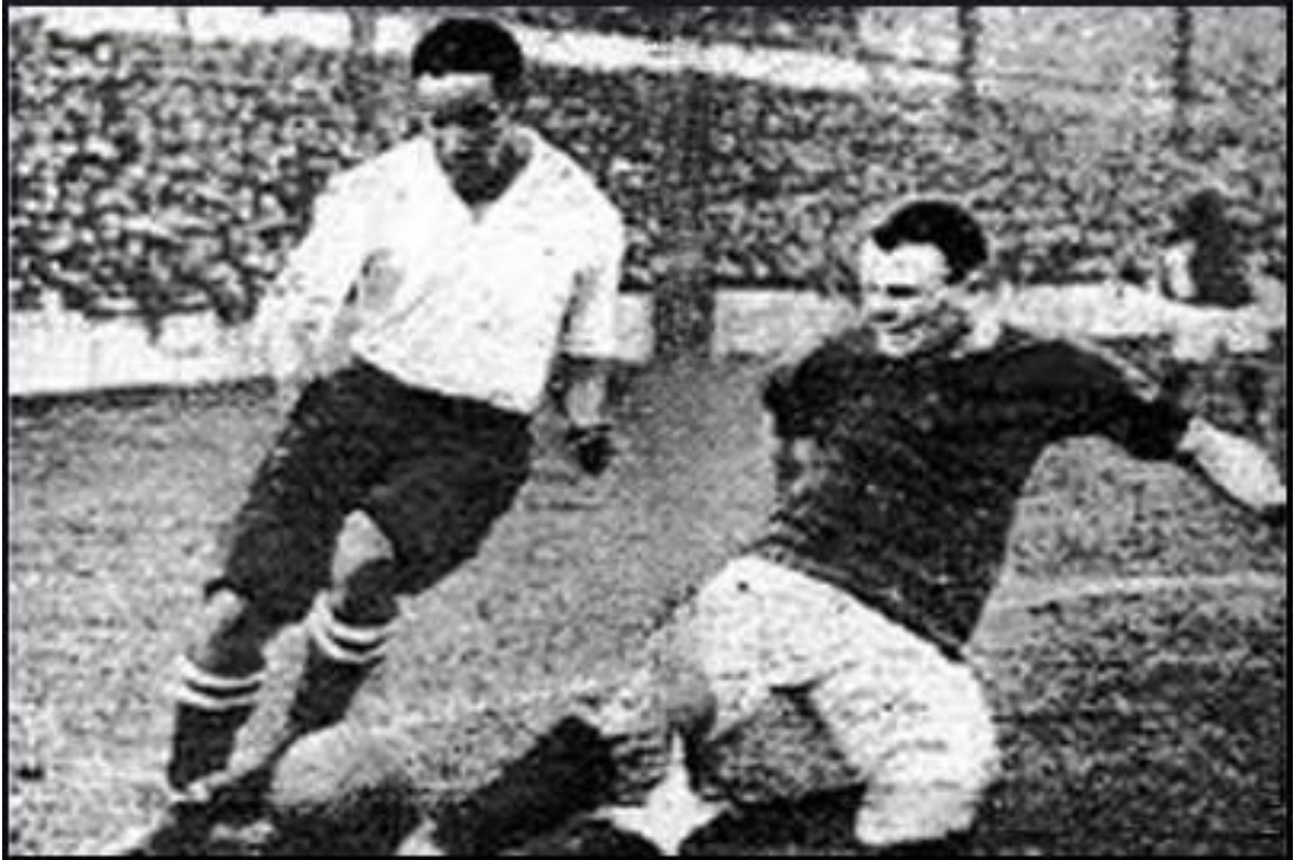
Walter Tull, footballer to soldier

through different gazes and disciplines. Furthermore, with the origins of football, the English game acting as nexus between the classes with Black and Brown players at the centre of it all.