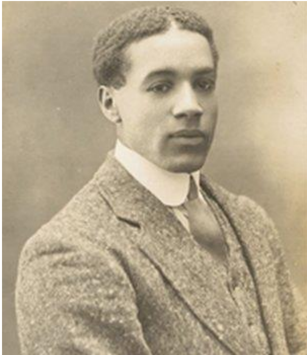
Walter fought in many battles including the infamous Battle of the Somme

ancestry might have been more recognisable than some others. In that class-conscious age, it is also possible that Walter's lowly origins were more likely to cause him to be associated with the placement of blackness on the social scale in a way that mixed-race officers higher on the social scale may not have been, their origins politely ignored, or at least not commented upon, by their upper-class peers" (p94).