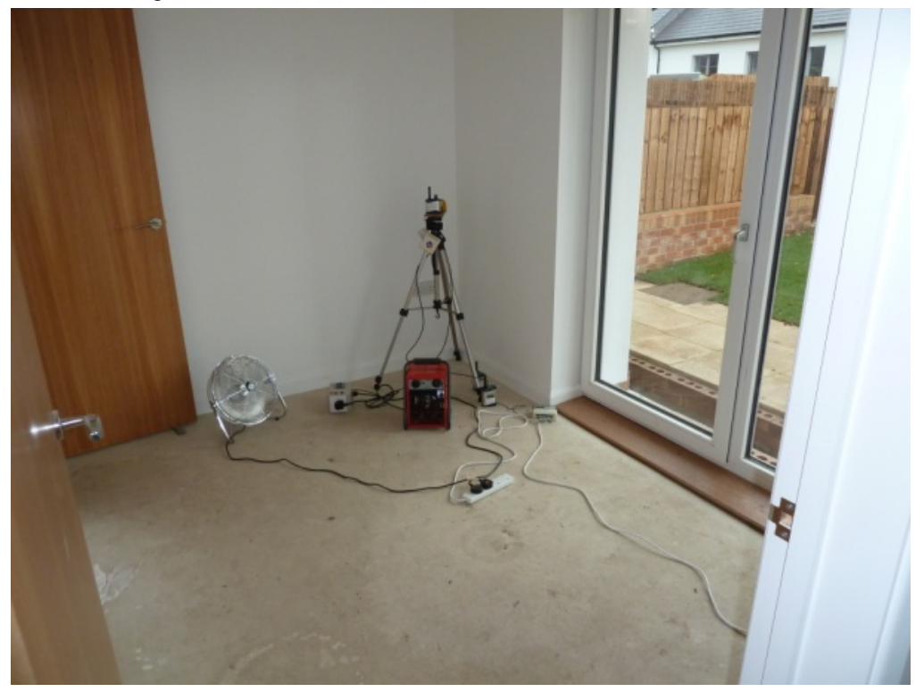
Figure 3 Main items of test equipment installed within a test dwelling.