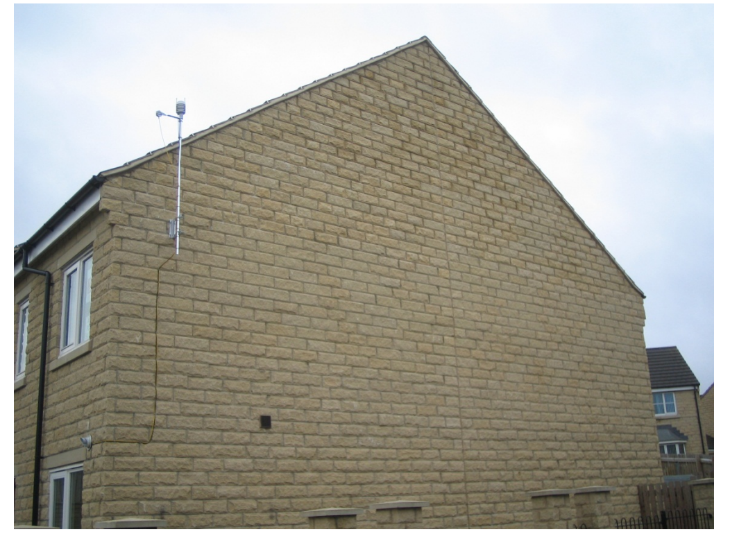
Figure 4 Coheating test weather station installed on a gable wall.

31 A photograph illustrating the weather station can be seen in Figure 4.